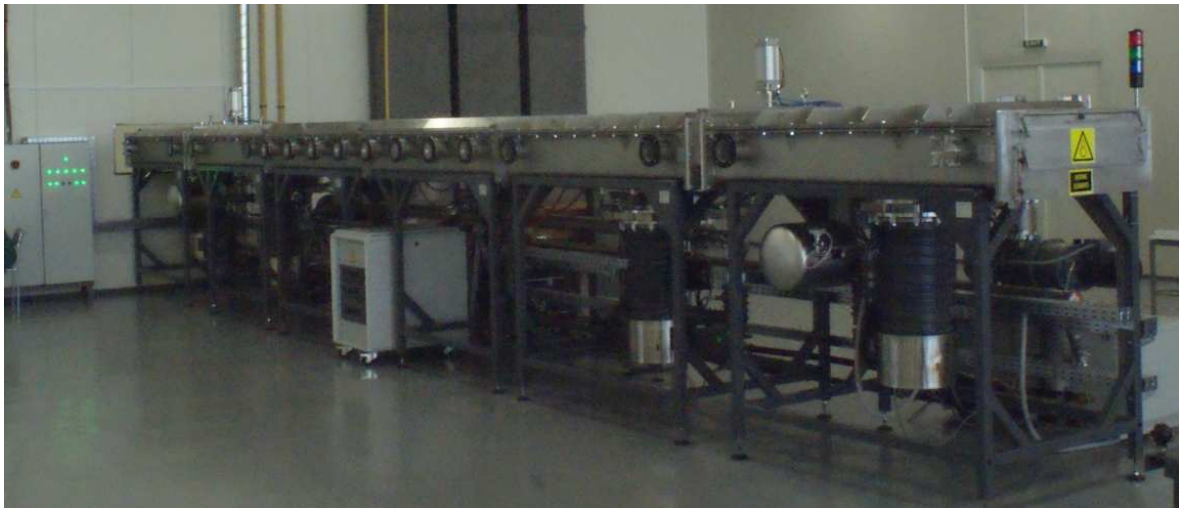
The Al/ZnO Sputtering System (ASSP-12)

The Al/ZnO Sputtering System (ASSP) forms the rearmost conducting layers in photovoltaic modules. It uses physical vapour deposition (PVD) to sputter zinc-oxide and aluminum layers. The first one diffracts the sun light, while the latter one reflects it back to the amorphous silicon layer to increase the module's efficiency. An 11.5 m long and nearly 6 tonne machine that is a composition of 6 individual chambers – it can handle multiple panels at once.