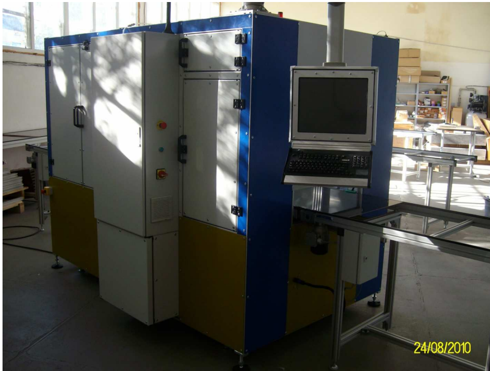
The Laser Scribing System (ASLS-30)

The Laser Scribing System (ASLS) is a high-precision laser cutting tool used in photovoltaic module manufacturing lines. Its purpose is to cut the deposited layers of the panels thus dividing them into individual solar cells. Continuously adjusted infrared and visible Nd:YAG lasers cut the metal and metal-oxide layers, while they move over the glass. A vacuum system removes any particles from the surface of the glass and from the air under it.